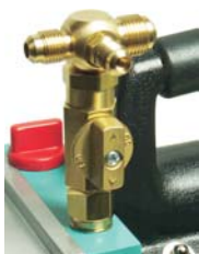
Intake Port w/Ball Valve