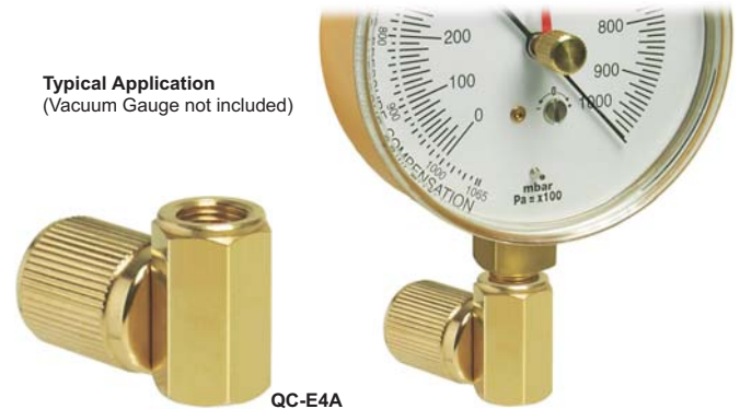
Typical Application (Vacuum Gauge not included)

STRAIGHT - 45° BEND and 90° BEND QUICK COUPLERS - Female SAE/ACME-16 Swivel Nut with Neoprene Gasket and Valve Core Depressor x FPT See Page 24e for Vacuum, Compound, and Pressure Gauges.